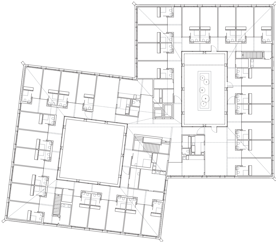
Plan 1 er étage