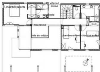
PLAN NIVEAU 1