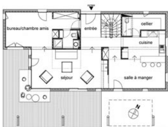
PLAN NIVEAU REZ DE CHAUSSEE