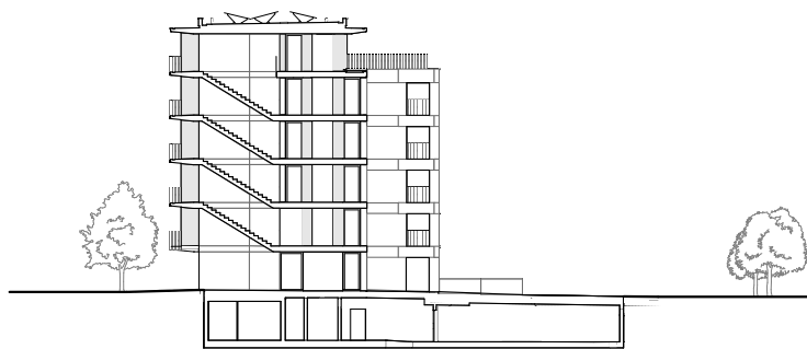
Coupe C-C 0 5.5 11 27.5m